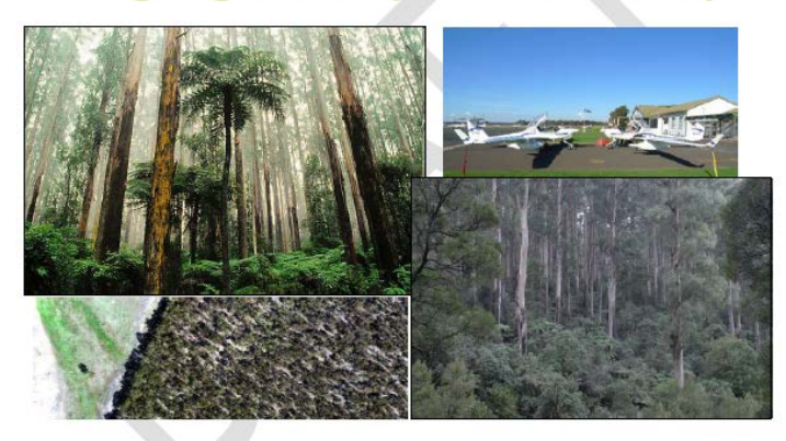
Deliverable 1. Literature review for determining optimal data primitives for characterising Australian woody vegetation and scalable for landscape-level woody vegetation feature generation.

Australian Woody Vegetation Landscape Feature Generation from Multi-Source Airborne and Space-Borne Imaging and Ranging Data (CRC-SI 2.07)